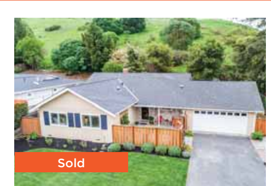
4 Buckingham Drive, Moraga

4 BED | 3 BATH | OFFERED AT $2,299,000 Represented Seller 3265ReliezCt.com