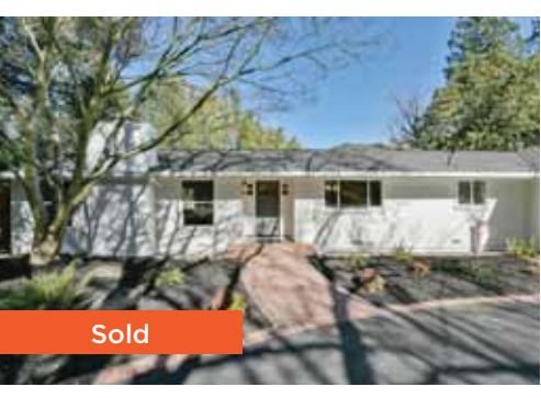
3376 Springhill Road, Lafayette ////

3 BED | 2 BATH | Offered at $1,095,000 Represented Seller 4BuckinghamDr.com