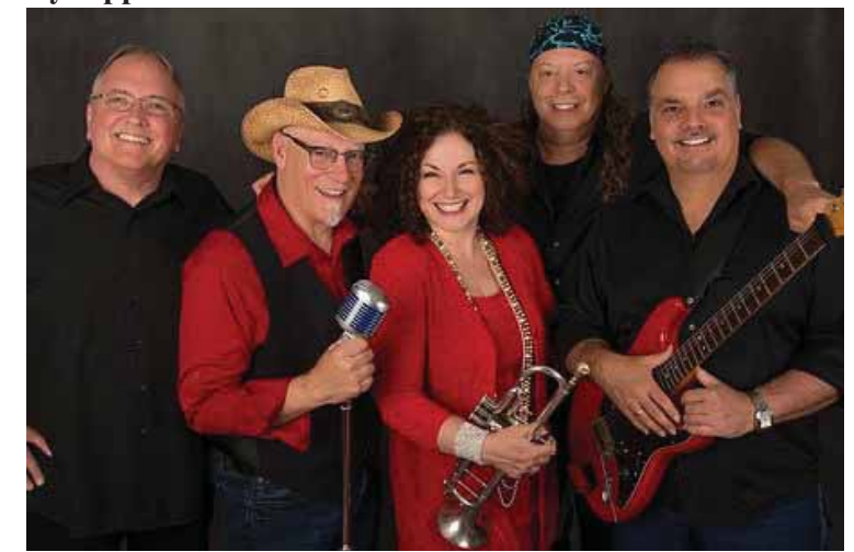
dr D band, Premier Funk, R&B and Rock