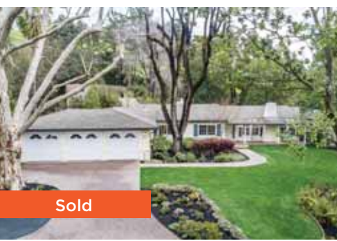
3265 Reliez Court, Lafayette

4 BED | 3 BATH | OFFERED AT $2,299,000 Represented Seller 3265ReliezCt.com